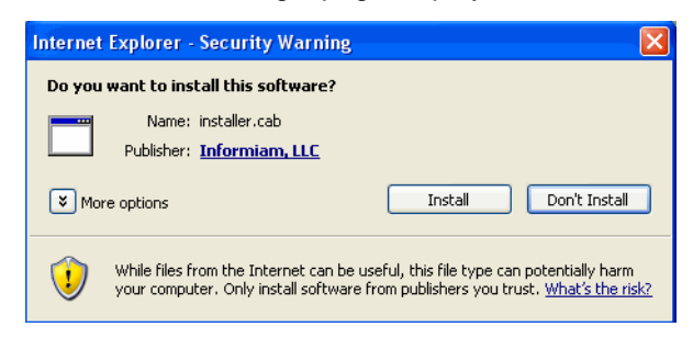
Figure 2: Install Security Warning

3. When prompted, click Install (Figure 2). The Login page displays.