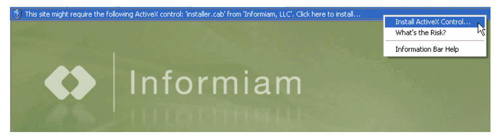
Figure 1: ActiveX Control

3. When prompted, click Install (Figure 2). The Login page displays.