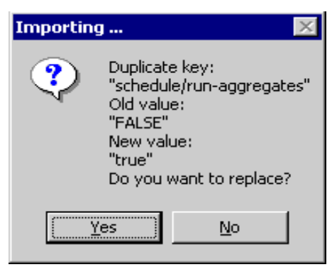
Figure 1: Resolving Option Differences in Configuration

5. Where the same options exist in both the configuration file and the current configuration, and where the values of these options differ, Configuration Manager prompts you to choose the preferred value, as shown in Figure 1. Click Yes or No. as appropriate.