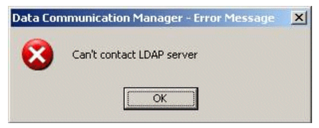
Figure 4: Error Message—LDAP Server is Not Accessible

To correct this error, do the following: