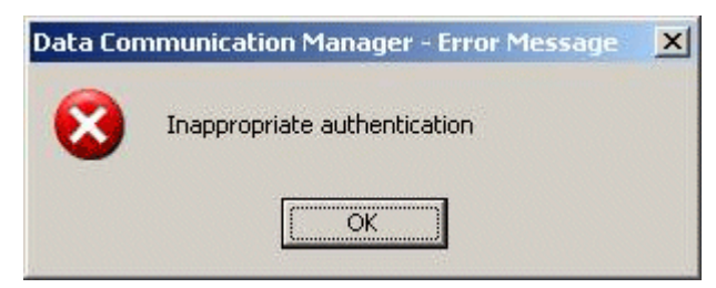
Figure 2: Error Message—Blank Password

To correct this error, log on to your GUI application with a valid non-empty password.