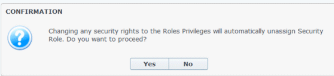
Figure: Confirmation Dialog

If the user's role privileges are changed in this module and they no longer match the privileges set in the Roles module, the following dialog appears: