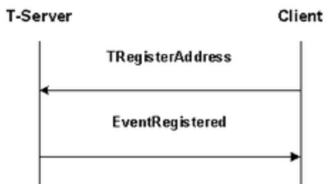
EventRegistered Feature Example