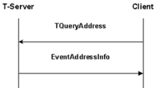
EventAddressInfo Feature Example