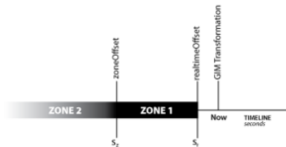
Two Zones Contain All Notifications

received up to two hours after Genesys Info Mart transformation. The Figure Two Zones Contain All Notifications illustrates the two zones and their boundaries.