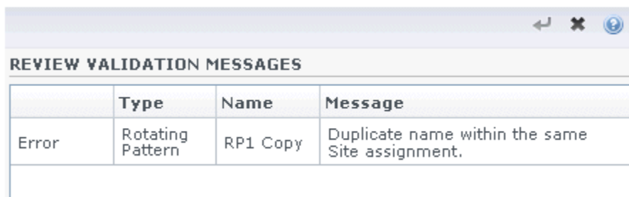
Figure: Rotating Patterns Error Message