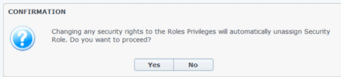
Figure: Confirmation Dialog

If the user's role privileges are changed in this module and they no longer match the privileges set in the Roles module, the following dialog appears: