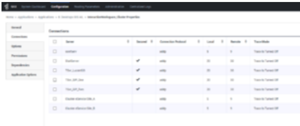
Example of Workspace in a cluster configuration for Disaster Recovery

You can define the addp parameters for all applications of the cluster from the Workspace application connections table. These parameters can be overridden in each server application.