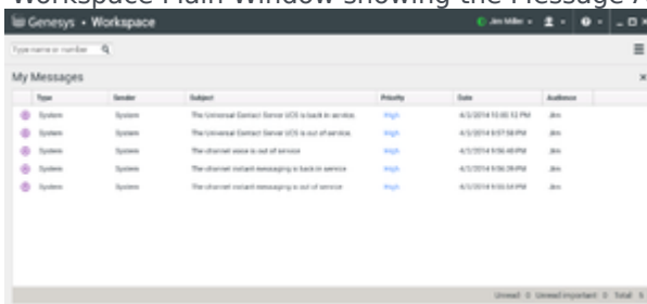
Workspace Main Window showing the Message Area open and displaying current messages