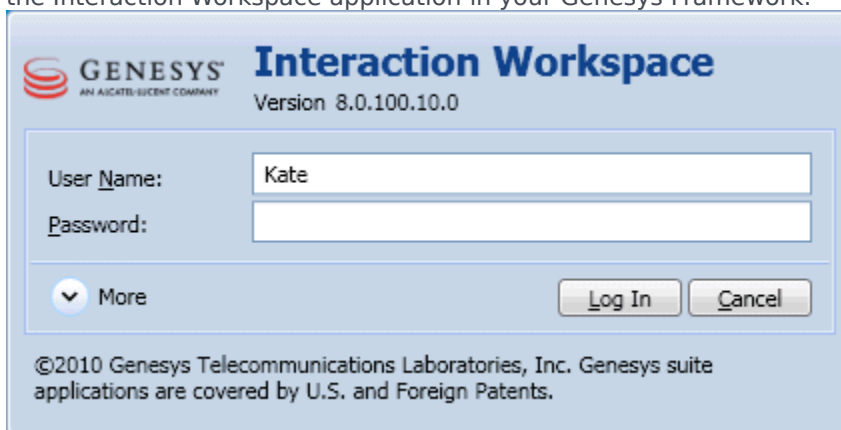
Interaction Workspace agent Login window with no connection parameters

The Interaction Workspace login window is displayed on the client desktop (see the Figure - Interaction Workspace agent Login window with no connection parameters ). The connection panel of the login window indicates that no connection has been specified. Before the agent can log in, you must connect to the Interaction Workspace application in your Genesys Framework.