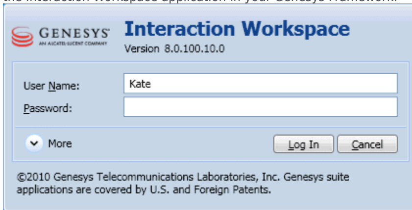
Interaction Workspace agent Login window with no connection parameters

The Interaction Workspace login window is displayed on the client desktop (see the Figure - Interaction Workspace agent Login window with no connection parameters ). The connection panel of the login window indicates that no connection has been specified. Before the agent can log in, you must connect to the Interaction Workspace application in your Genesys Framework.