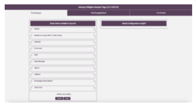
Launcher tool for Genesys Engage API (click to enlarge)

Once all the necessary configuration details are entered, click on the Launch button to launch Widgets.