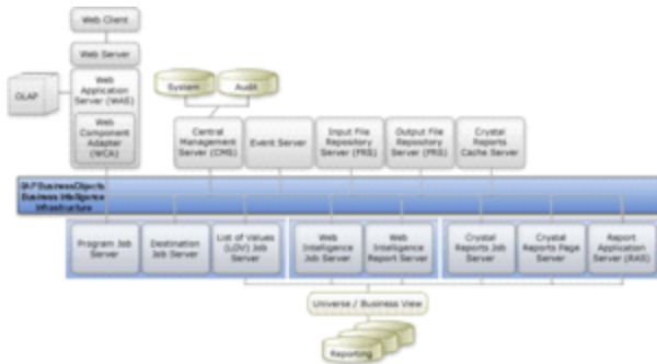
Components of the BI Architecture

SAP BusinessObjects Business Intelligence Platform (BI 4.1) is the business intelligence software that powers GI2 8.5. The tools that are furnished within these software suites enable you easily and quickly to produce meaningful results, and provide analysis for more effective decision making. A full BI installation contains all of the components shown in the Figure Components of the BI Architecture .