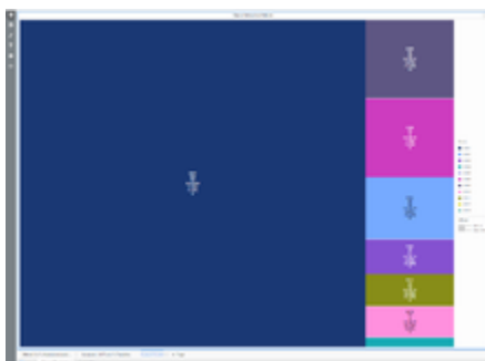
Weekly Queue Summary Dashboard: Queue Volume

The ( Dashboards and Queues folders) Weekly Queue Summary Dashboard provides visualizations you can use to assess the weekly performance of