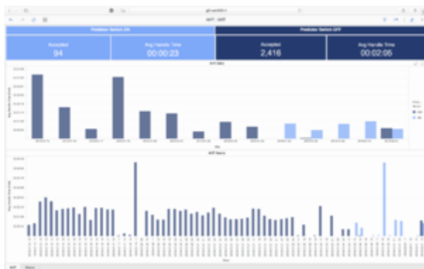
The AHT tab

The Predictive Routing - AHT & Queue Dashboard provides a dashboard-style summary that you can use to evaluate the impact on contact center efficiency of enabling Genesys Predictive Routing (GPR). The dashboard provides tools that allow you to compare how various metrics change when GPR is enabled.