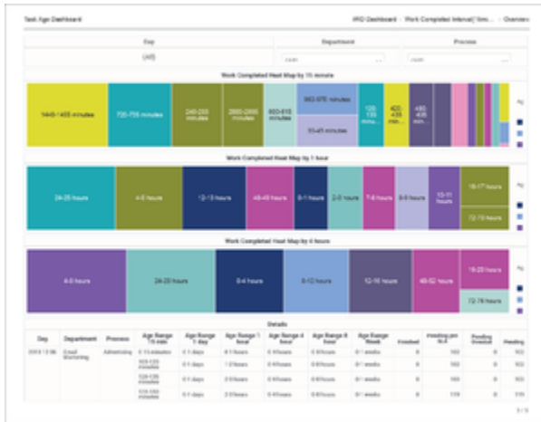
Work Completed Interval [15min] tab

Note that the term dashboard is used interchangeably with the term dossier . Dashboards provide an interactive, intuitive data visualization, summarizing key business indicators (KPIs). You can change how you view the data in most reports and dashboards by using interactive features such as selectors, grouping, widgets, and visualizations, and explore data using multiple paths, through text and data filtering, and layers of organization.