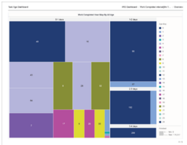
Work Completed Interval [8hr] tab

Note that the term dashboard is used interchangeably with the term dossier . Dashboards provide an interactive, intuitive data visualization, summarizing key business indicators (KPIs). You can change how you view the data in most reports and dashboards by using interactive features such as selectors, grouping, widgets, and visualizations, and explore data using multiple paths, through text and data filtering, and layers of organization.