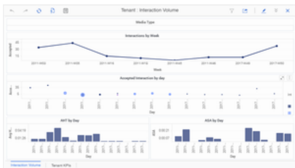
The Contact Center Dashboard on a mobile device