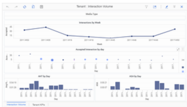
The Contact Center Dashboard on a mobile device